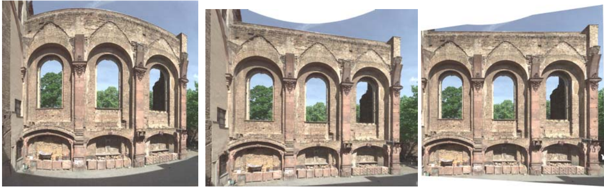
Fig. 5: Tangential projection (90° panorama sector, projection on a tangential plane, rectification)