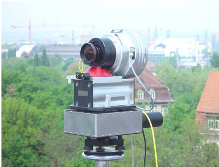
Fig. 1: EyeScan M3 digital panoramic camera